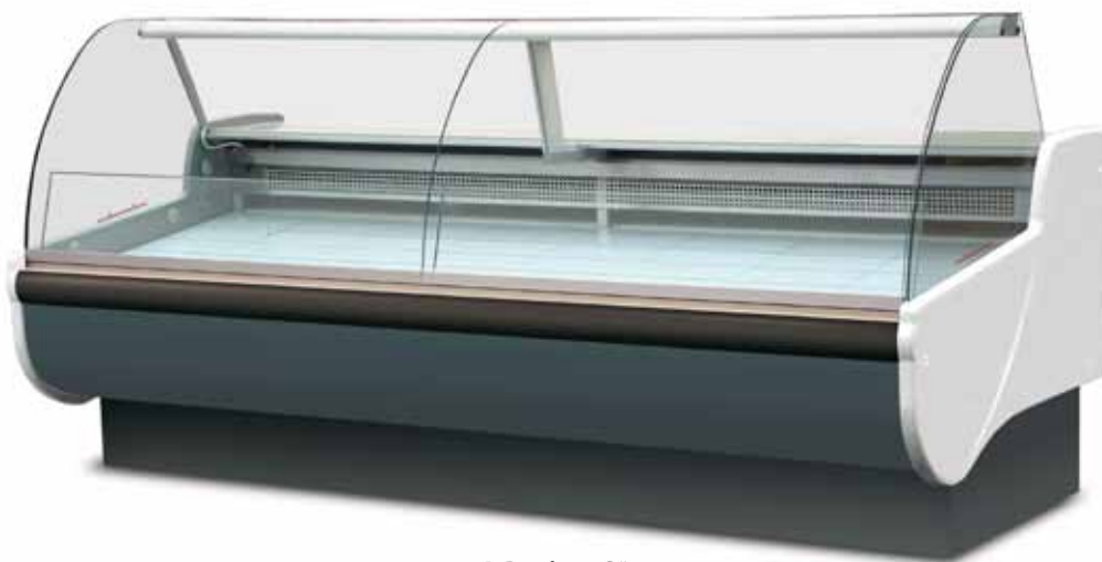
I-Basia 2 S*